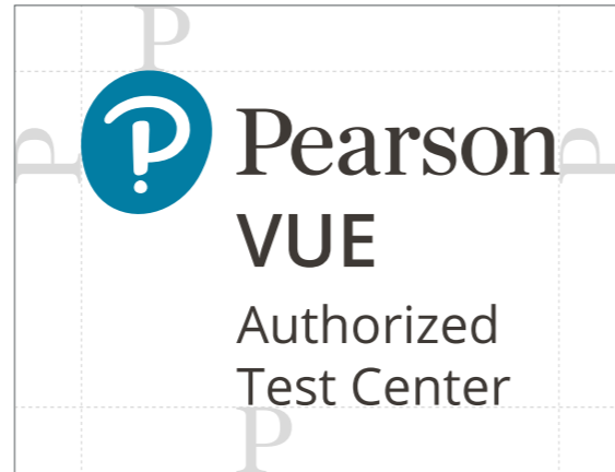
Pearson VUE® Authorized Test Center Standard US logo