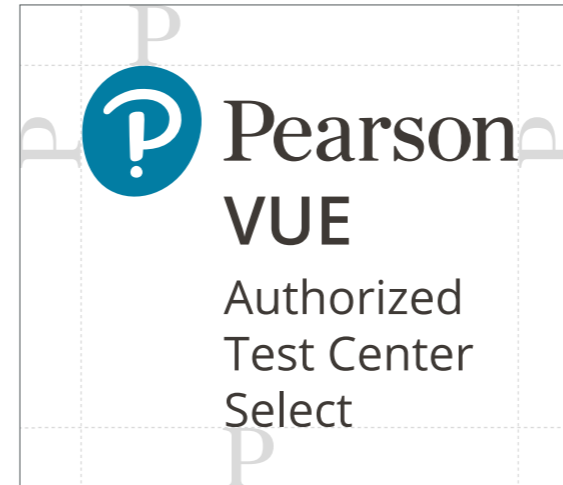
Pearson VUE® Authorized Test Center Select US logo